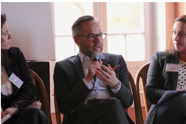
Michael Roth , German Minister of State for Europe, discussing with participants of the #EuropeanTownHall Meeting in Lisbon, March 2016

This trans-European project has brought together young, dedicated members of various civil society backgrounds from initially 6 countries (France, Germany, Greece, Italy Portugal and Spain; later Poland and