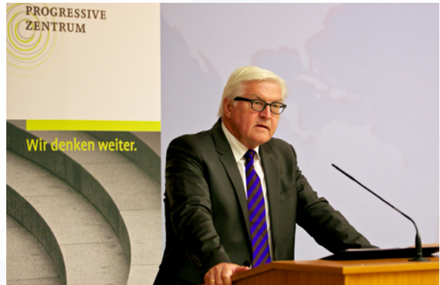
Frank-Walter Steinmeier , then German Minister for Foreign Affairs, speaking at the DIALOGUE ON EUROPE Opening Conference in Berlin, June 2016

the UK) to analyse pressing EU-wide challenges and to elaborate concrete policy recommendations for the national and European level. In each country we worked together with one or more local partner organisations such as think tanks or foundations.