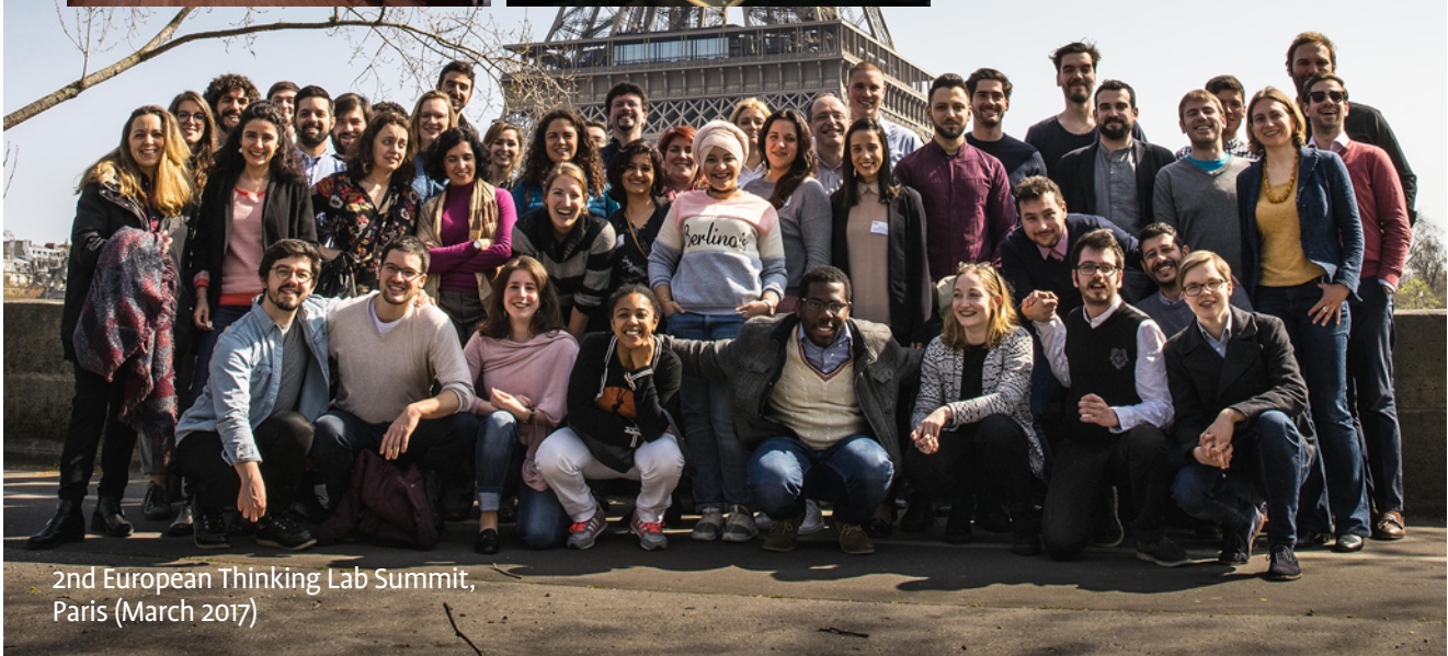
2nd European Thinking Lab Summit, Paris (March 2017)