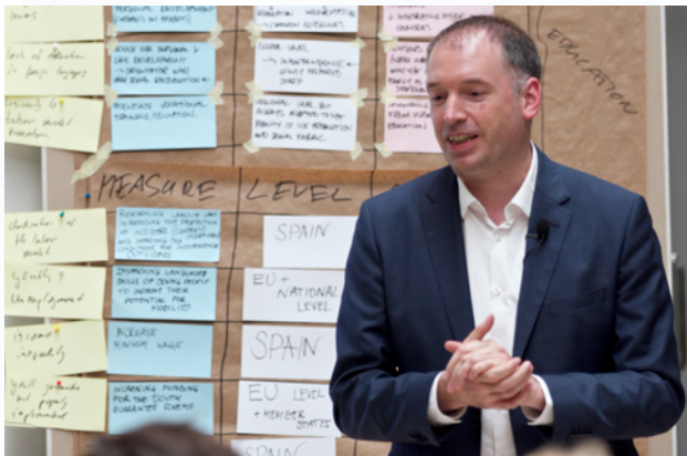
Niels Annen, today Minister of State at the German Federal Foreign Office, replying to participants of the #EuropeanTownHall Meeting in Madrid, June 2016

representatives elaborated independently policy analyses and recommendations. 60 of the #EuropeanTownHall participants cooperated in four so-called ‘ Thinking Labs ’ (according to the four main topics) via digital collaboration means and personal meetings at four ‘ European Thinking Lab Summits ’. Since the last Summit in Rome in October 2017, the Thinking Labs have finalised their policy recommendations. These will be presented during the Closing Conference in Brussels.