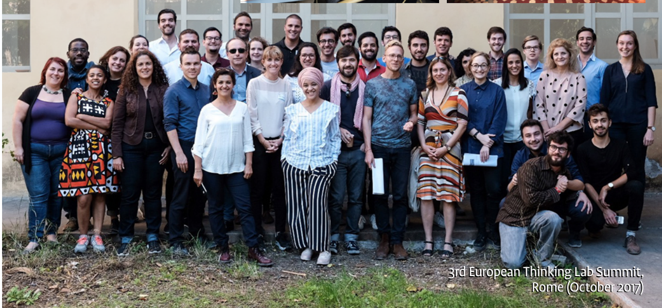
3rd European Thinking Lab Summit, Rome (October 2017)