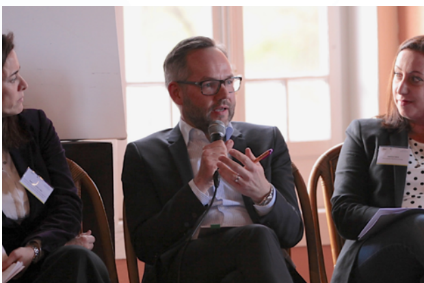
Michael Roth, German Minister of State for Europe, discussing with participants of the #EuropeanTownHall Meeting in Lisbon, March 2016

DIALOGUE ON EUROPE unfolded in three phases. From December 2015 to June 2016 bilateral #EuropeanTownHall Meetings took place in five Southern European cities, mostly with the participation of the German Minister of State for Europe, Michael Roth . Hence, during this period civil society literally met politics. From June 2016 to October 2017 by contrast, civil society