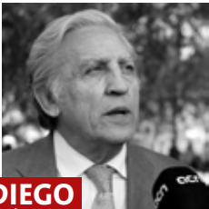
DIEGO LÓPEZ GARRIDO

As the Deputy Secretary-General of the Party of European Socialists (PES), she is responsible for democracy policies, political organisation development, funding, migration policies, electoral research, electoral exchange and training and is also a member of the PES Presidency. She was the first woman to be elected International Secretary of the National Executive Board of the Dutch Labour Party (PvdA) a position she held from 2003 to 2012.