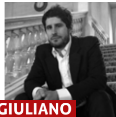
GIULIANO DA EMPOLI